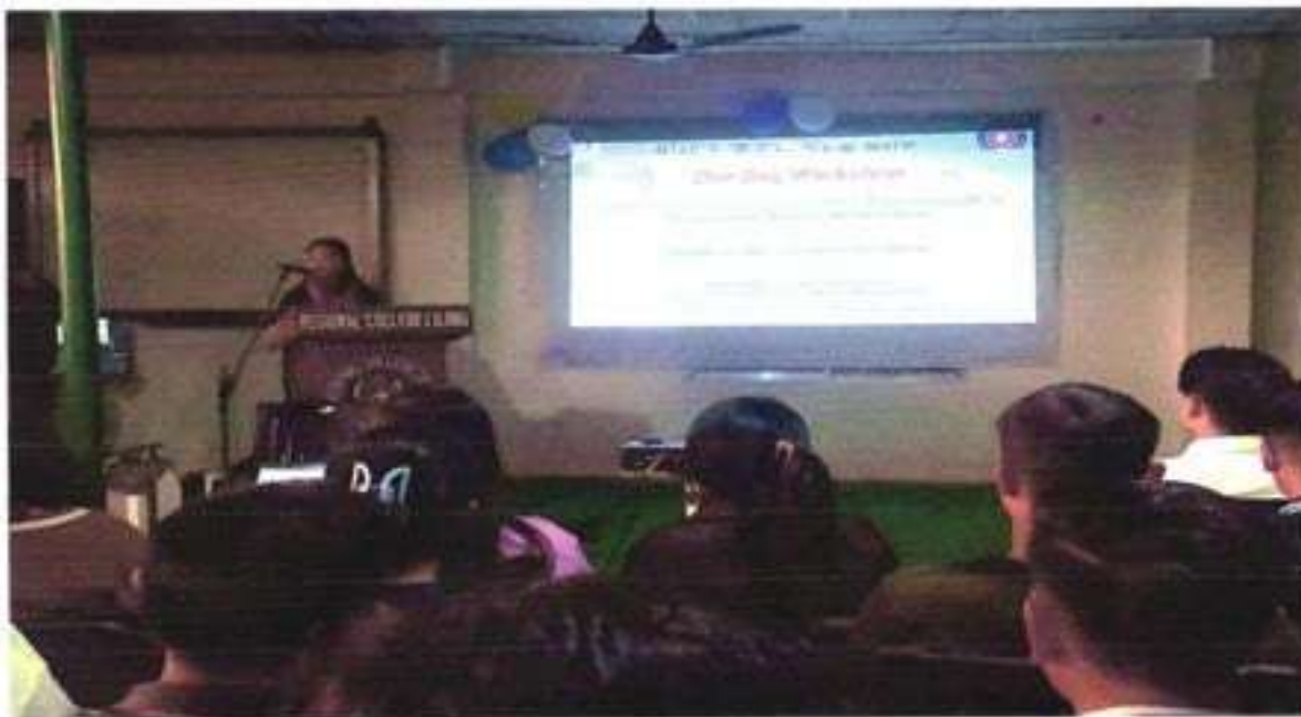
One-Day Workshop on Information and Communication Technology (ICT) on 4 th February 2023