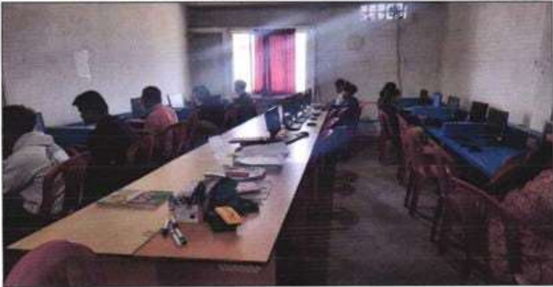
Students attending computer class at Diana Computer on 10 th April 2019