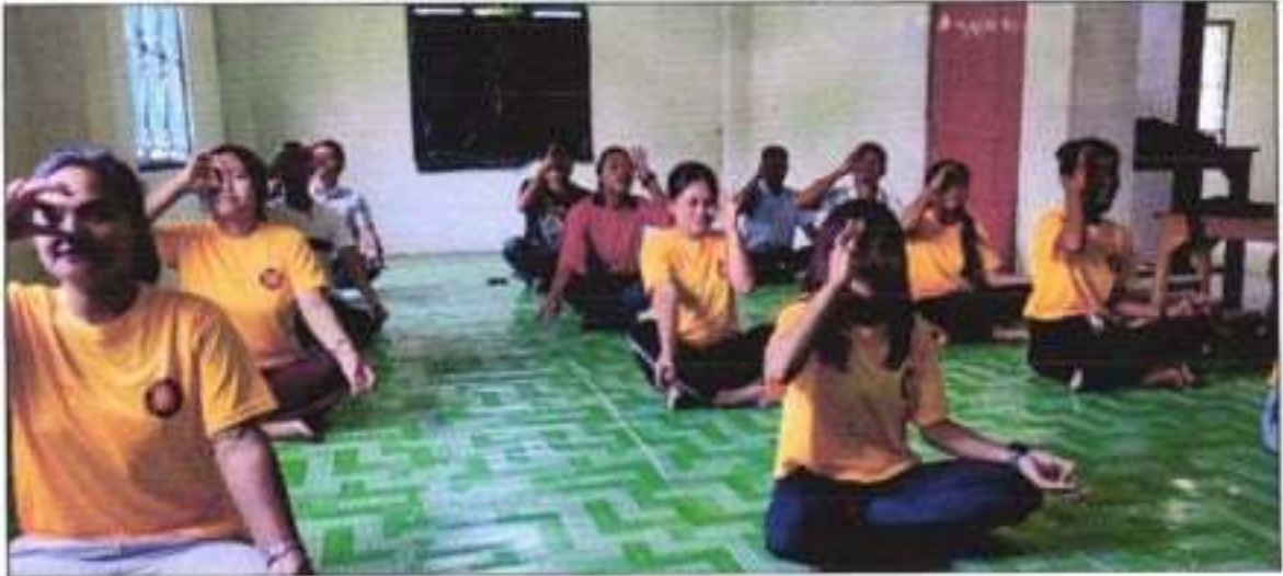
Students meditating on 19 th February 2022 during the seven day Yoga Camp