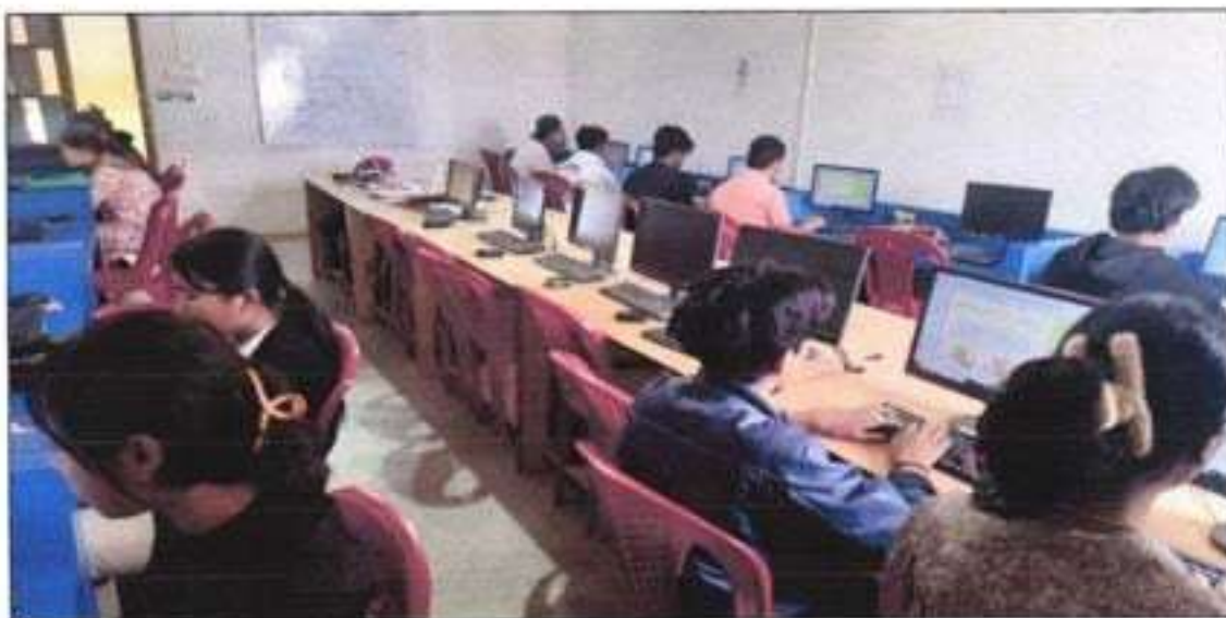
Students attending a-ten day training program on the topic "Fundamentals of Computer Application" on 17 th December 2020