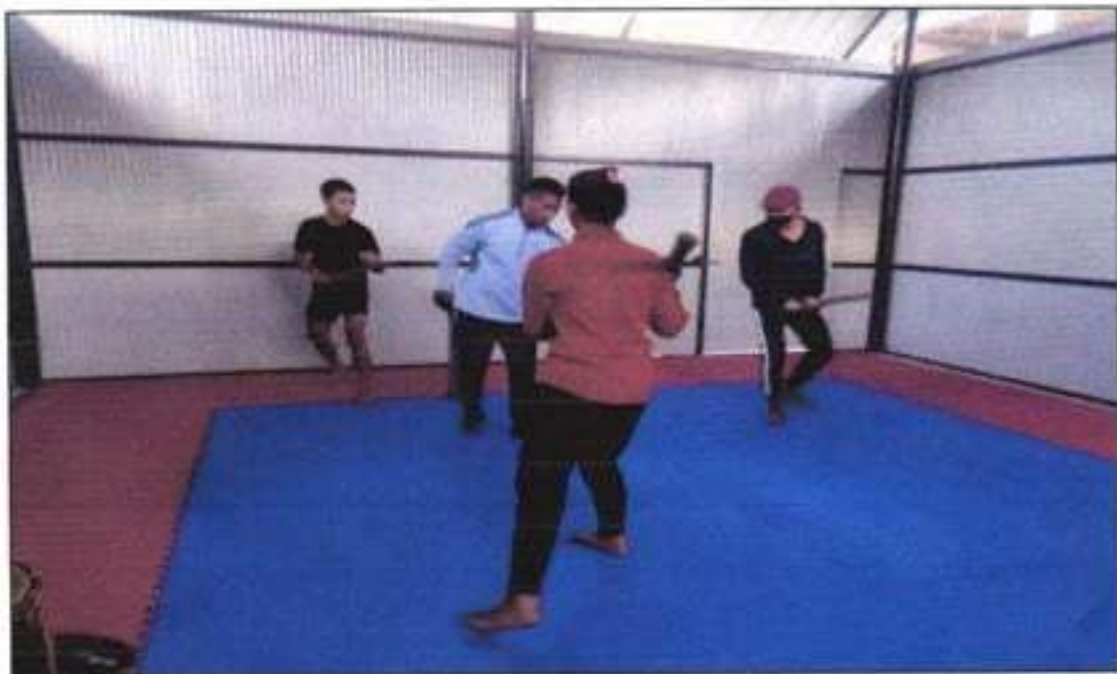
Students Practicing Thang-Ta with the instructor on 6 th February 2019