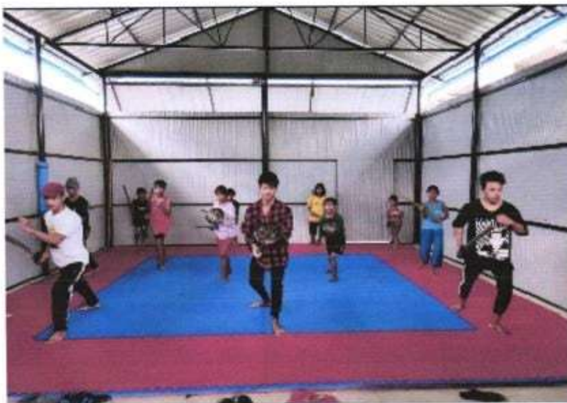
Students practicing Thang-Ta on 10 th March 2023