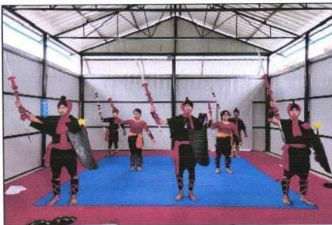
Students performing Thang-Ta on the 10 th of February 2020 as part of the ten-day Martial Arts Training program on Thang-Ta