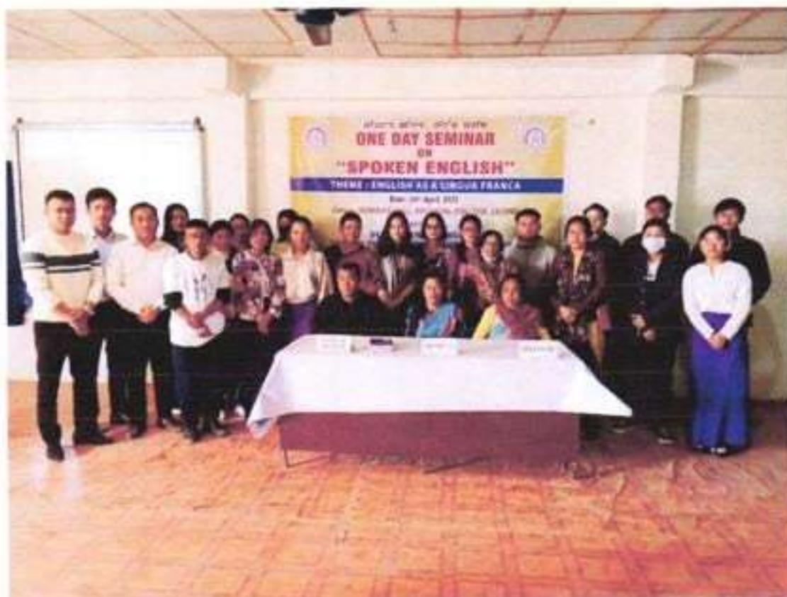
A group photo of teachers with paper presenters and participants on 24 th April 2023