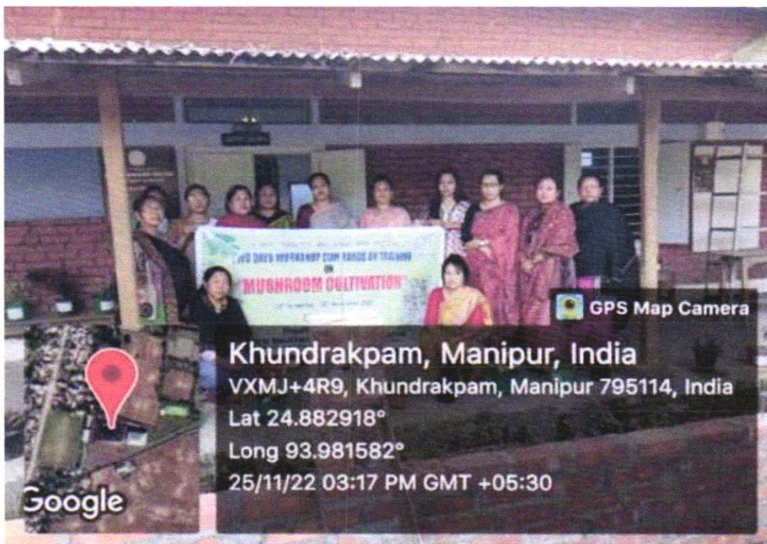
Day 1: Workshop Cum Hands on Training On “Mushroom Cultivation”

LILONG CHAJING (IMPHAL-WEST) MANIPUR. (Permanently affiliated to M.U. Included in 2(f) &12(b) of U.G.C.Act.)