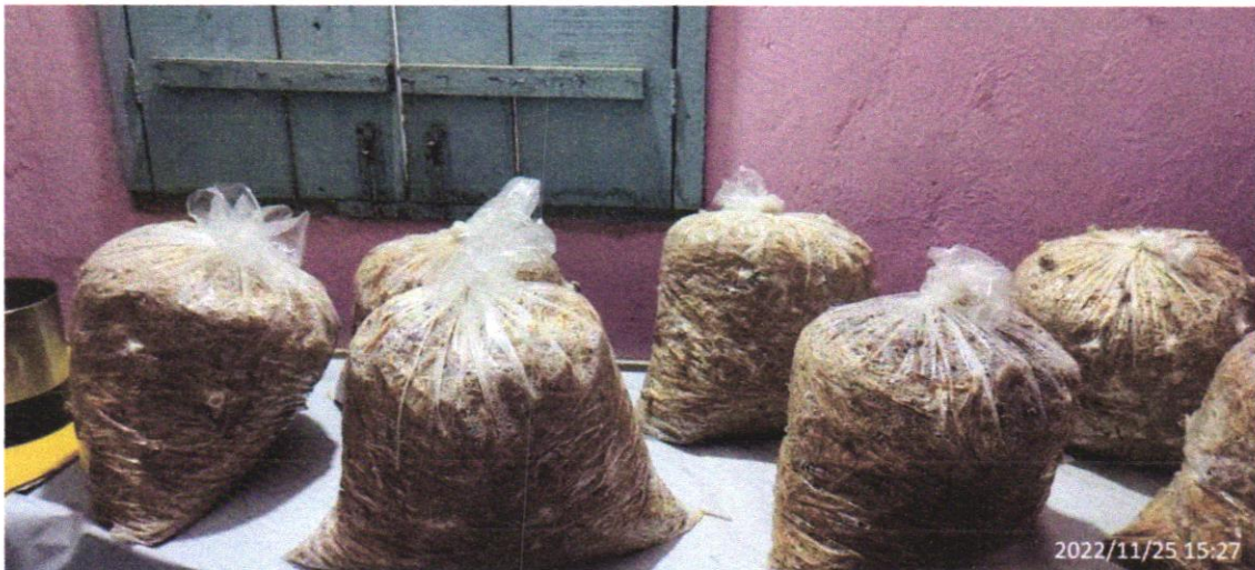
Day 2: Workshop Cum Hands on Training On “Mushroom Cultivation”

LILONG CHAJING (IMPHAL-WEST) MANIPUR. (Permanently affiliated to M.U. Included in 2(f) &12(b) of U.G.C.Act.)