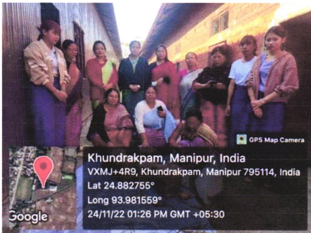
Day 1: Workshop Cum Hands on Training On “Mushroom Cultivation”

LILONG CHAJING (IMPHAL-WEST) MANIPUR. (Permanently affiliated to M.U. Included in 2(f) &12(b) of U.G.C.Act.)