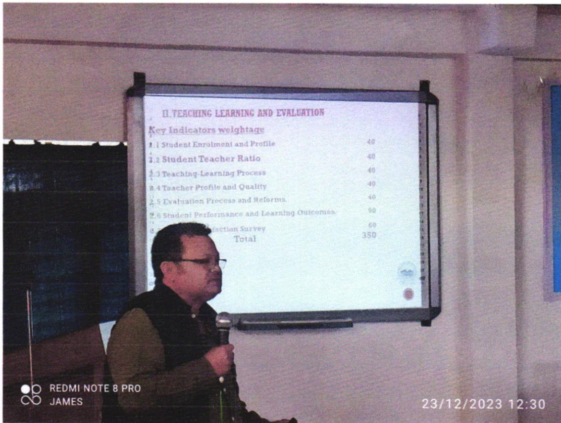
One Day Workshop On NAAC Accreditation

LILONG CHAJING (IMPHAL-WEST) MANIPUR. (Permanently affiliated to M.U. Included in 2(f) &12(b) of U.G.C.Act.)