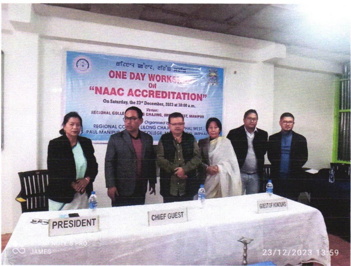
One Day Workshop on NAAC Accreditation

LILONG CHAJING (IMPHAL-WEST) MANIPUR. (Permanently affiliated to M.U. Included in 2(f) &12(b) of U.G.C.Act.)