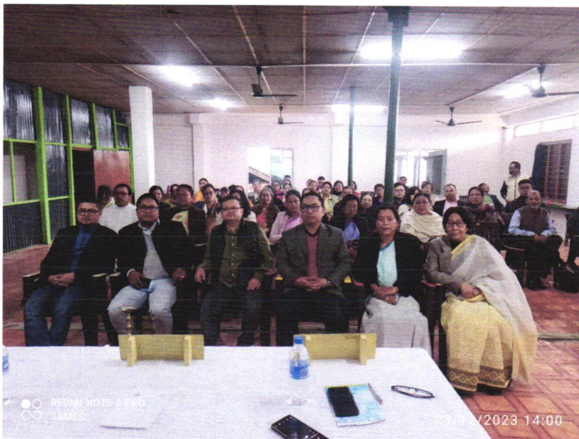
One Day Workshop on NAAC Accreditation

LILONG CHAJING (IMPHAL-WEST) MANIPUR. (Permanently affiliated to M.U. Included in 2(f) &12(b) of U.G.C.Act.)