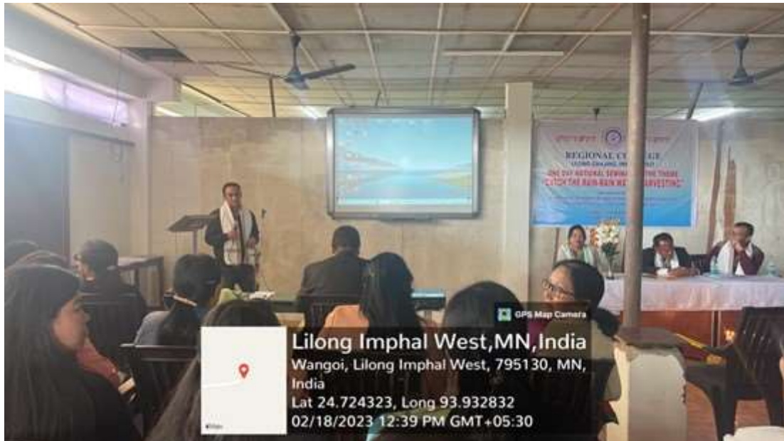
Geotag Photo 3 :One-Day “Catch the Rain: Rain Water Harvesting – 2023”

LILONG CHAJING (IMPHAL-WEST) MANIPUR. (Permanently affiliated to M.U. Included in 2(f) &12(b) of U.G.C.Act.)