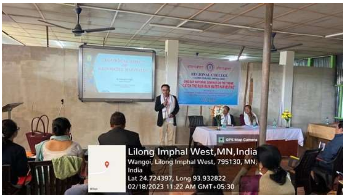
Geotag Photo 1 :One-Day “Catch the Rain: Rain Water Harvesting – 2023”

LILONG CHAJING (IMPHAL-WEST) MANIPUR. (Permanently affiliated to M.U. Included in 2(f) &12(b) of U.G.C.Act.)