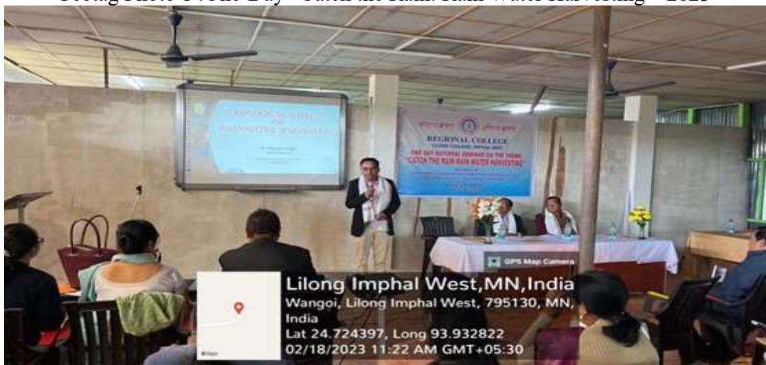
Geotag Photo 2 :One-Day “Catch the Rain: Rain Water Harvesting – 2023”