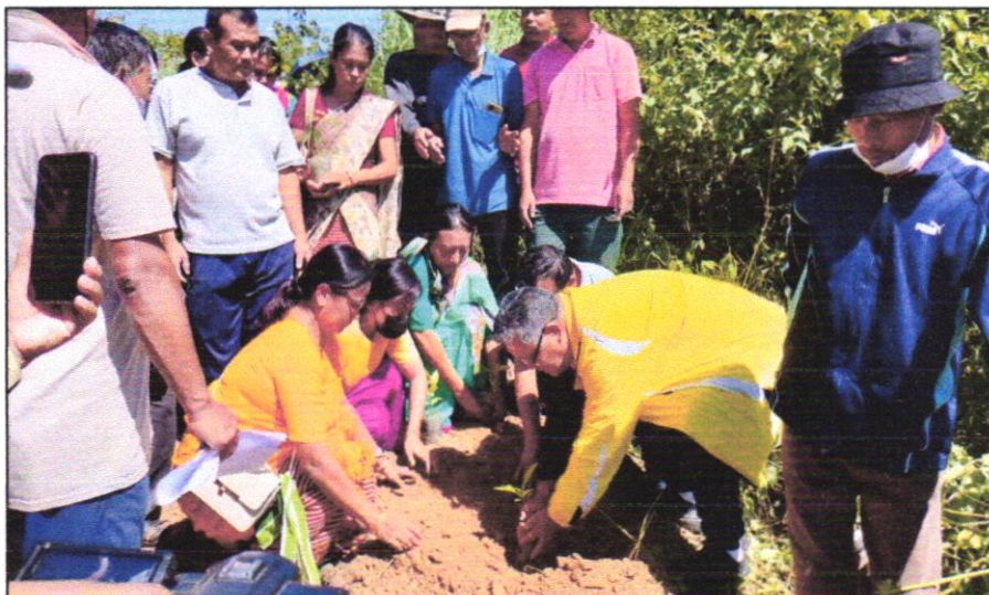
TREE PLANTATION WITH GOVERNING BODY, FACULTIES AND ALUMNI