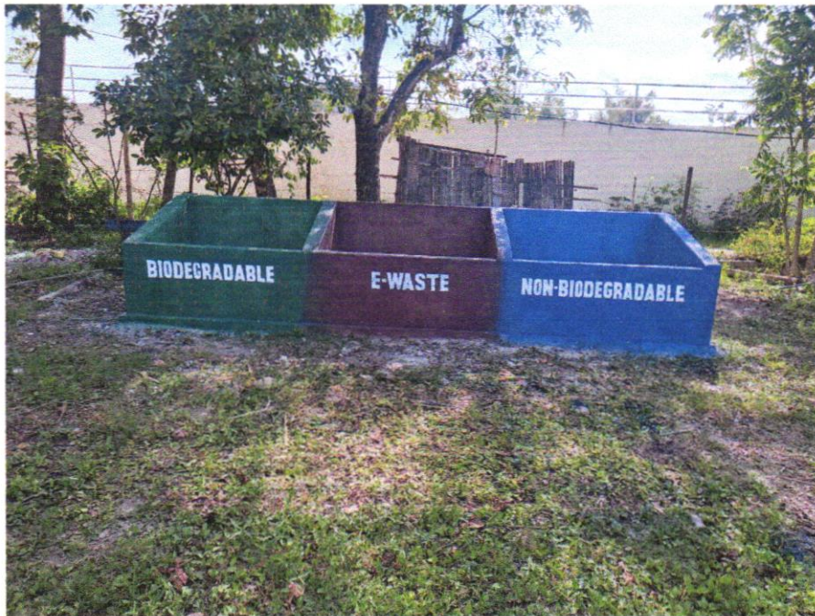
PUCCA DUMPING SITE

LILONG CHAJING (IMPHAL-WEST), MANIPUR (Permanently affiliated to M.U. Included in 2(f) & 12(b) of U.G.C.Act.)